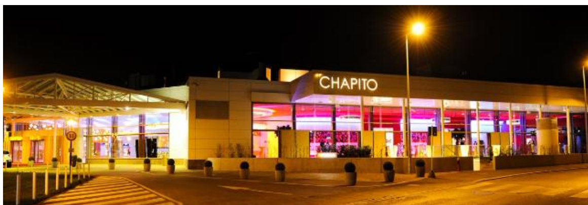
Chapito du CASINO 2000 (the only casino in Luxembourg)