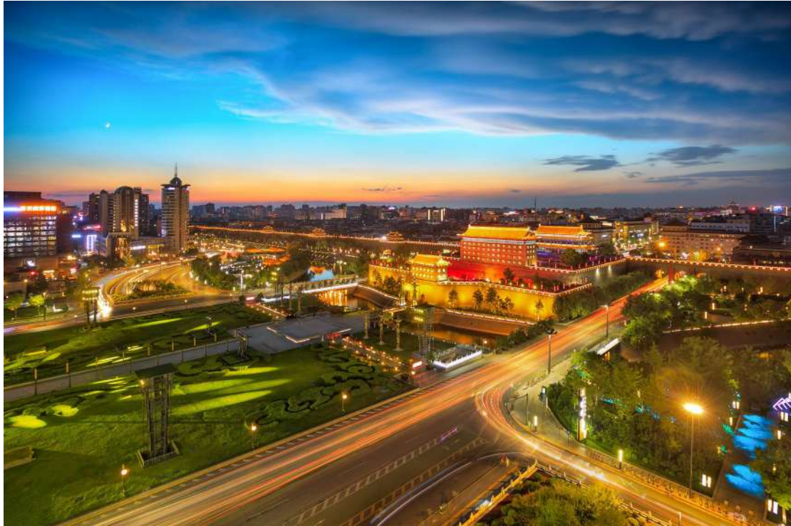
South City Gate, The YONGNING Gate 永宁门景区

About South Gate: YONGNING Gate, it was the South Gate of the ancient Xi'an during Tang Dynasty, located in the middle west of the south city wall. During Ming Dynasty in year 1374-1378DC, the ancient city was enlarged, however the South City Gate remains. It was then named YONGNING Gate. 概况：永宁门，西安城墙正南门，位于南城墙中部偏西。明洪武七年至十一年（1374年至1378年），扩建西安府城，此门沿用为南门，易名“永宁门”。